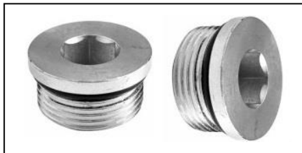
THREADED FLANGED HEXAGON SOCKET