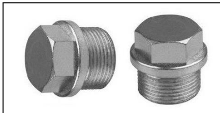
THREADED HEXAGON FLANGED HEAD