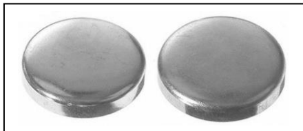
Material: Fe P04 UNI 5866 – Zinc plated