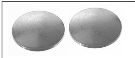
Material: Fe P02 UNI 5866 – Zinc plated